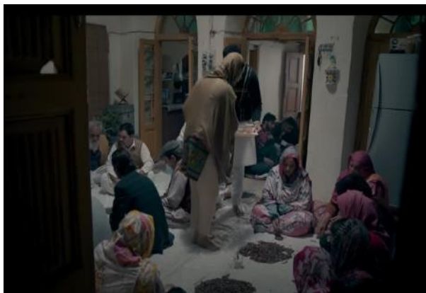
Dua for Rahat`s Wife

To deconstruct the language that either perpetuates or challenges the deeply embedded preconceptions that are associated with marginalized communities, discourse analysis becomes a useful technique.